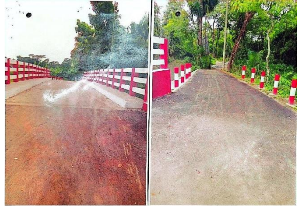
Construction of 15.00m Long RCC Girder Bridge on Karter hat Kalitak road-dakatia Reg. NGPS-Sikder bari bridge via siddque shodagor bari at Ch.80m. ID No. 509545211 under Lalmohan Upazila, District- Bhola