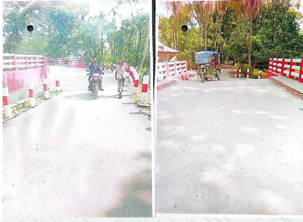
Construction of 17.00m Long RCC Girder Bridge on Chowmohoni Bazar (RHD) to Shibpur Kahsher Hat GC Road at ch. 4800 m ID No-509912005 under Tazumuddin Upazila, District- Bhola