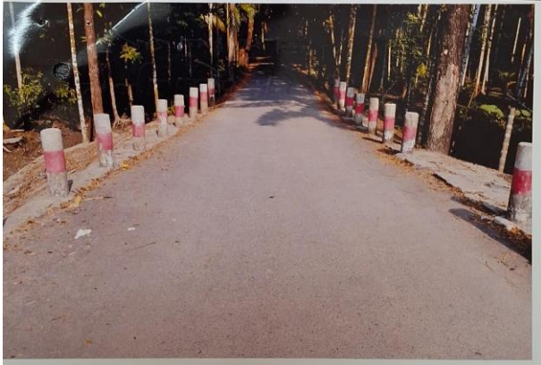
Construction of 16.00m Long RCC Girder Bridge on Maniram Munshir hat to Tabgi Road at Ch.13m. ID No. 509215113 under Borhanuddin Upazila, District- Bhola