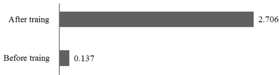
Figure-2. Comparison of average number of Skill-based problems solving capacity pre and post training.

Figure 2 shows that before training the average number of Problems solved among three problems was 0.137. However, after the training the average number of Skill-based problems solved was 2.76.